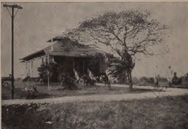
Corozal Police Station